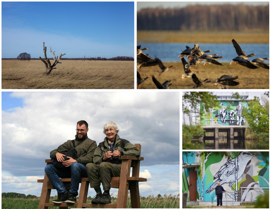
Bird watching

The final stop of the field trip will be the Cape Ventė ornithological and bird ringing station on the eastern coast of the Baltic Sea. The station has the largest live traps for migratory birds in Europe, as well as the original "zigzag" traps installed here, which catch live birds in all weather conditions throughout the year. The live traps are used to catch birds alive for ringing and monitoring purposes. After that they are set free. During the migrating season, up to 200,000 birds pass Cape Ventė daily. It is one of the largest bird migration routes in Europe.