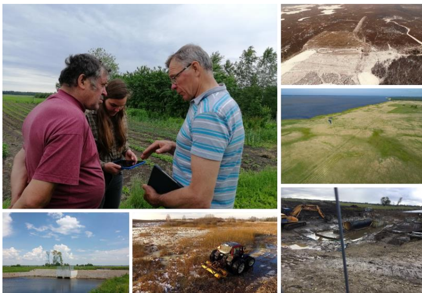
Farmers restoring habitats

We will stop for lunch at a restaurant situated in the area of the Kintai fishponds.