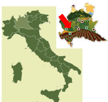
Lombardia region in Italy